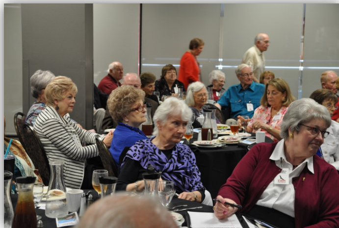
Looking forward to being with all our ASP friends and acquaintances at the new 2019-2020 ASP Luncheons.