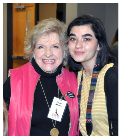
was looking good.